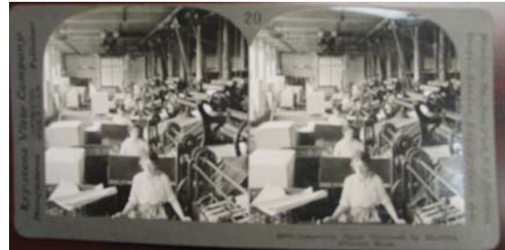
Inspecting Paper Delivered by Machine, Holyoke, Mass.