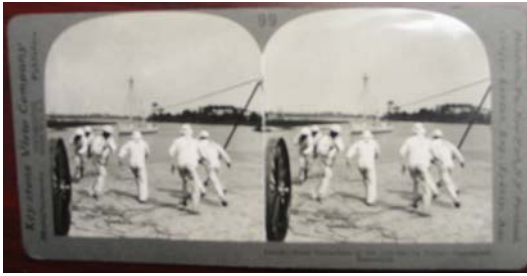
Life – Savings Corps – Jamestown Exposition, 1907