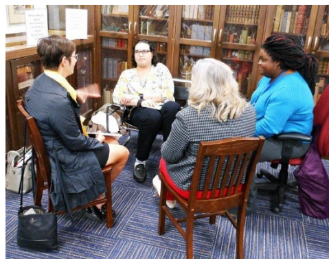
A volunteer "book" telling her story to three readers