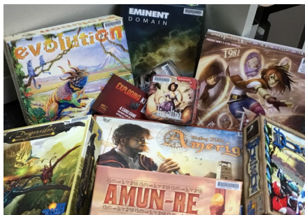
Some of the games available at the Library!

Towards the end of the Spring Semester, the Elihu Burritt Library will begin offering a variety of board games to our users. The Board Game Collection currently consists of 25 titles, all of which were donated to the library by staff members and game publishers over the course of the past year. Collecting these games has been no mere Trivial Pursuit. Rather, by offering games to the CCSU community, the library hopes to – among other things – draw a new audience into the library, enhance the atmosphere on the first floor, and supplement coursework with games of academic value.