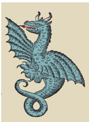
Basilisk Konrad Gesner, Historiae Animalium, 1551