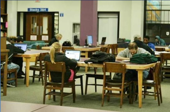
Studying on the second floor